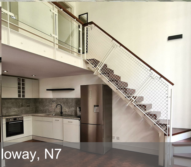
The Beaux Arts Building, Holloway, N7